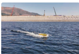
Water Resource Survey